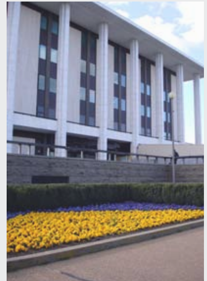
Exterior of the National Library of Australia in Canberra.

The National Library of Australia is the country's largest reference library with over nine million items in its collection, including a surprising number of art works. In a new series of Hidden Treasures, Betty Churcher presents an insider's guide to some of the little known and rarely displayed art treasures held by the National Library. From her unique vantage point, Churcher makes intriguing historical connections between paintings and engravings, photography, manuscripts and artefacts, illustrated journals and diaries. These are fascinating tales about the creative process and the works themselves that offer a tantalising insight into Australia's culture and heritage.