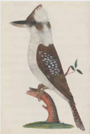
George Raper's 1789 watercolour drawing Laughing kookaburra (Dacelo novaeguineae).

First Fleet captain John Hunter copied the work of young First Fleet midshipman George Raper to produce his famous sketchbook showing life in Botany Bay. Raper's own First Fleet paintings, begun in 1788, show his skill and fine eye for detail in capturing the birds and flowers of NSW. They were acquired by the National Library of Australia in 2004 after lying undiscovered and undisturbed for more than 200 years in an English manor. While Hunter, who became the second Governor of NSW, didn't share Raper's talents with a paintbrush, both men shared equally an excitement and enthusiasm for recording what they found in Sydney Cove in 1788.