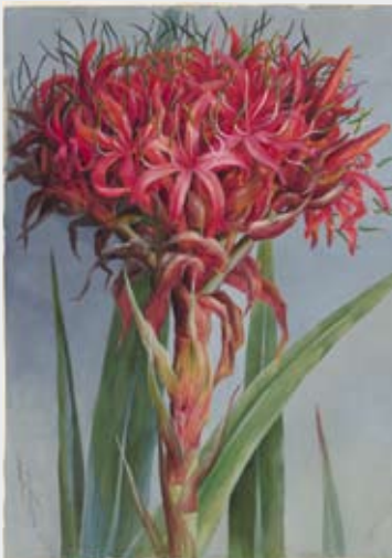
Ellis Rowan's 1880s watercolour Banksia serrata . From the Ellis Rowan Australian Collection. Image courtesy of National Library of Australia

Petite Victorian flower painter Ellis Rowan rocked the Australian art establishment when she won the Centennial Art Prize in 1888, defeating established male artists including Tom Roberts and Frederick McCubbin and prompting a complaint by the Victorian Art Society. A feisty and tenacious adventurer, Rowan travelled Australia searching for rare and exotic species to paint before venturing into the jungles of New Guinea to find inspiration for her exquisite flower paintings. Using watercolours and gouache on coloured paper, she painted many unique varieties, on one occasion claiming to have dangled by a rope over a precipice, hundreds of metres above the rainforest below, to paint a tree orchid. The bitterness of her male rivals lasted until well after her death in 1922. Some 900 of her watercolours are now in the National Library collection.