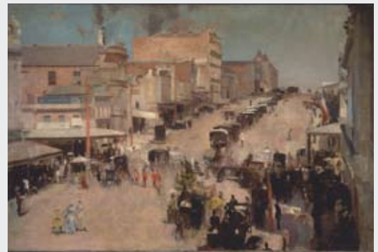
Tom Roberts' 1886 oil painting Bourke Street, Melbourne (aka Allegro con brio ).

Artists working in different media have created a visual time capsule showing Melbourne in the late 1800s. The first, an album of photographs by the city's official photographer Charles Nettleton, features Bourke Street, Melbourne, Looking East, an 1878 photograph showing men chatting in the middle of sleepy Bourke Street, while the second, a painting by Tom Roberts circa 1886, shows the same street bustling with pre-Christmas trade. The painting, originally named Allegro con brio , was altered in 1890 when the artist added three figures to the foreground. Aerial maps of the city in the National Library collection show the massive transformation that took place in Melbourne over the 50 years from 1838. The photograph, the painting and the aerial map provide snapshots of early Melbourne, each one supplying information particular to the medium.