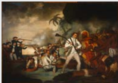
George Carter's 1781 oil on canvas painting Death of Captain Cook.

Captain James Cook's untimely return to Hawaii ended with his violent death, the details of which are portrayed in numerous conflicting illustrations.