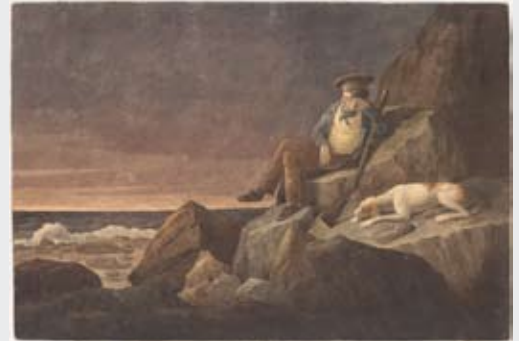
Augustus Earle's 1824 watercolour painting Solitude, watching the horizon at sun set, in the hopes of seeing a vessel, Tristan de Acunha [i.e. da Cunha] in the South Atlantic. From the Rex Nan Kivell Collection.

Earle, who was stranded for nine months with his dog Jemmy on an island in the South Atlantic Ocean, when his ship sailed without him in March 1824, filled his time recording life on the island until his art supplies ran out. The artist and his dog appear in many of his island paintings. Earle was eventually picked up by a ship bound for Sydney and during the few years he lived in the colony he became its foremost painter. Included in the National Library's collection is a 1826 oil portrait of Bungaree, the first Aborigine to circumnavigate Australia.