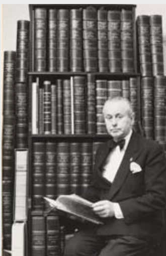
James Mortimer's 1950s photograph Portrait of Rex Nan Kivell .

New Zealander Rex Nan Kivell was an avid collector of anything to do with 18th century exploration and the early settlement of Australia and New Zealand. His fine collection of 12,000 items ranges across a third of the globe and spans three centuries. Among its priceless treasures are one of the earliest maritime atlases of the world, Dell'Arcano del Mare (Secrets of the Sea), compiled in Italy in 1643; a catalogue of sea monsters; the first map of the coastline of Australia and even a handsome silver kettle with built-in spirit lamp given by Queen Charlotte to Sir Joseph Banks. But Sir Rex de Charambec Nan Kivell, as he became, concealed a secret from the world—he was born Reginald Nankivell, the illegitimate son of a New Zealander.